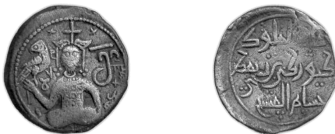
Giorgi III (1156-1184). Follis. d=23 mm. 5.75 gr. 1174.